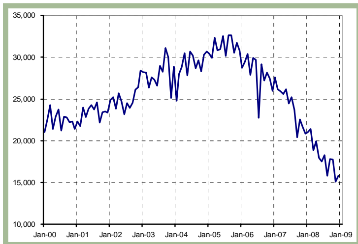
Chart 3: Seasonally-Adjusted Monthly Transactions Subject to the Real Estate Excise Tax

Because of the dot-com collapse and the special problems Boeing faced as a result of the 9/11 terror attacks, the recession in the early part of this decade was especially deep and long in the Seattle area. As a result, prices here did not rise a great deal during the 2001–03 period of falling mortgage rates. Having largely missed the first half of the house price boom, the subsequent excesses were nowhere near as extreme in this area as in other places in the country and the downturn has not been anywhere near as severe. For Seattle, the most recent index value is 13 percent below the peak.