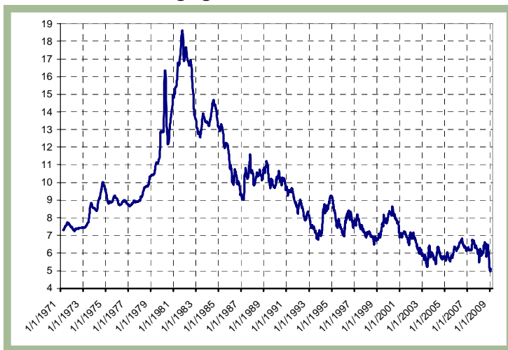
Chart 2: Interest Rate on 30-Year Conventional Mortgage

From mid-2003 the upward impetus to home prices shifted from mortgage rates to demand growth due to the strengthening economy, to relaxation in lending standards and, ultimately, to self-fulfilling expectations of further price increases. By early summer 2006, the Federal Reserve had taken the Federal Funds rate back up to 5.25 percent, 30-year conventional mortgage rates hit 6.8 percent, and house prices had stopped rising in many markets.